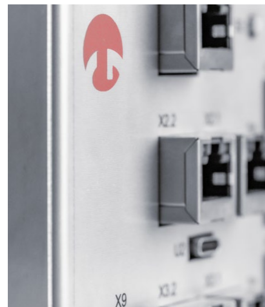
Gehring GCU 3.0

Increase your production capacity and extend the life of your machines. Welcome to the future of Gehring control technology!