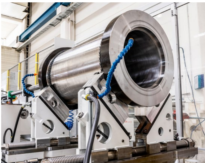
Diameter control of the honed raceway